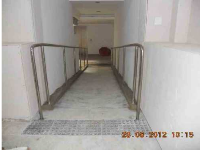
Basement ramp completed with handicap hand rail