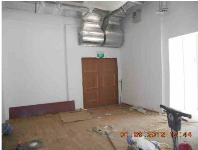
Timber screen in progress