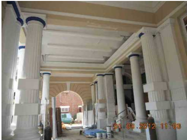
Car poach in progress with painting, installation of cove light, repairing modules of pillar and plastering