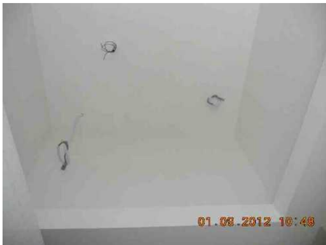
Toilet at 2 nd STY (ceiling, fire rated wall, painting) completed