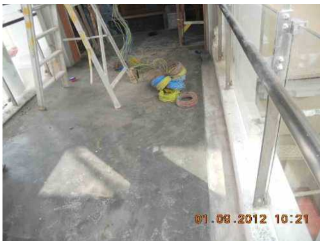
Construction of ramp at 2 nd STY link way was completed