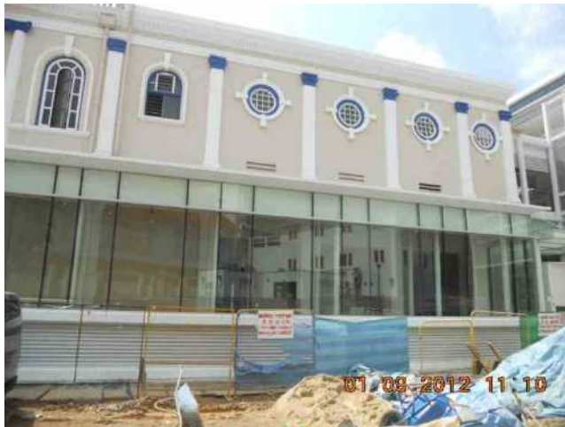
Right side wing completed (glass curtain wall, roof, timber floor, painting, smoothing of column, ACMV & electrical)