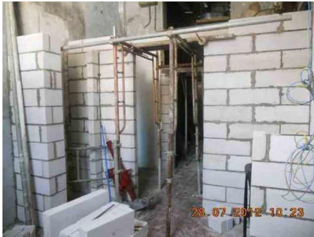
Erection of light weight wall completed, plastering in progress at 2 nd STY (waiting room & dressing room)