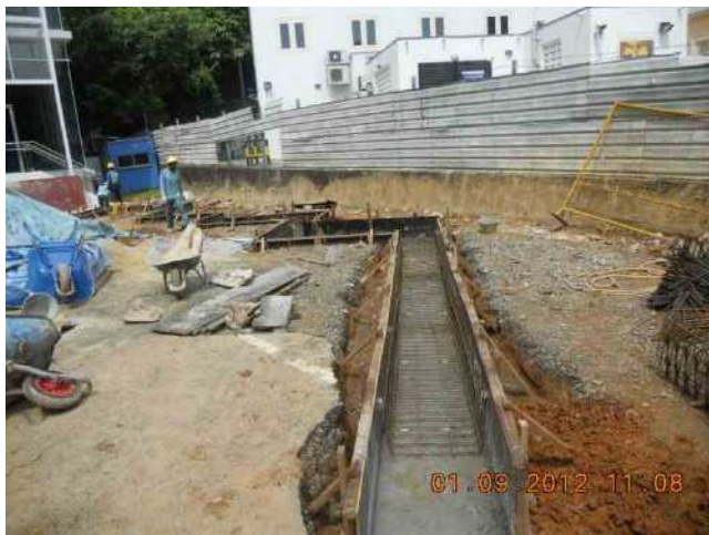
Construction of car park lots in progress.