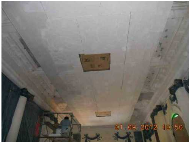
Ceiling work completed at breakout room 2