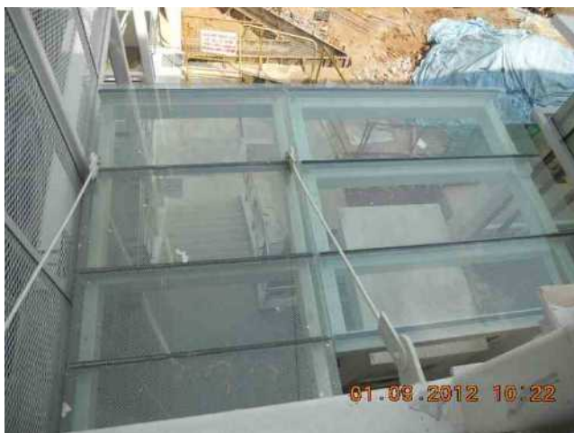
Glass canopy completed at both vertical platform lift & St 06.