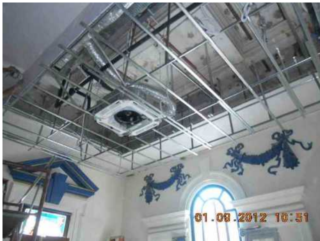
Ceiling works in progress at breakout room 1