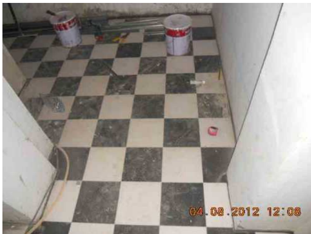
St-04 and passage to basement bar completed with tiling on floor.