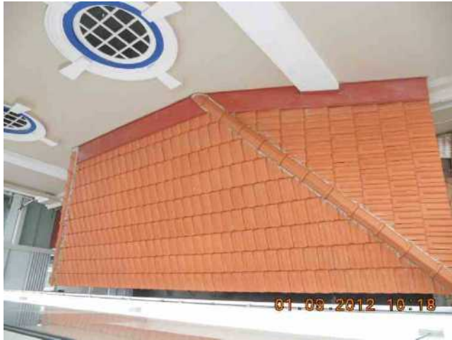
Pitch roof & lower roof completed