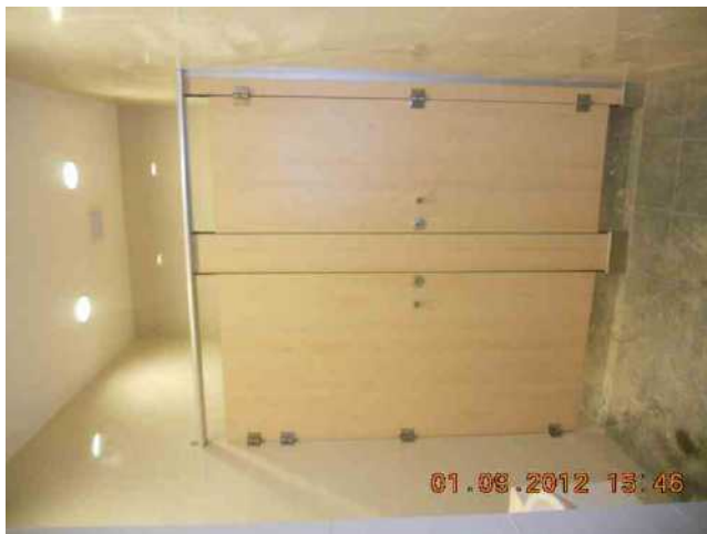
1 st STY toilet completed