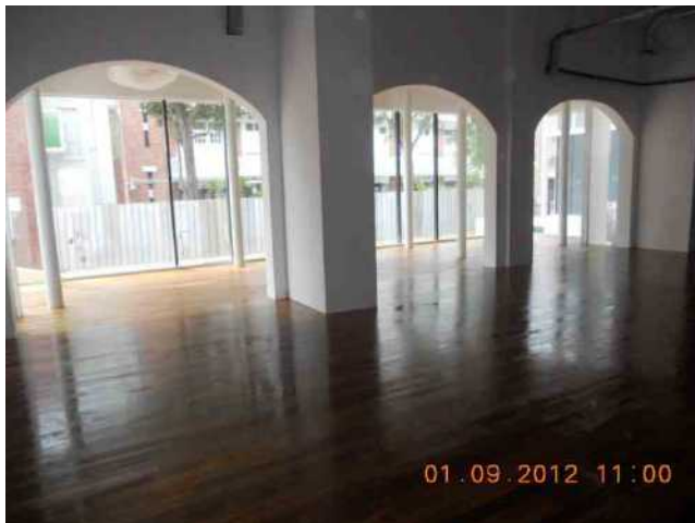
Polishing in progress at 1 st STY restaurant floor