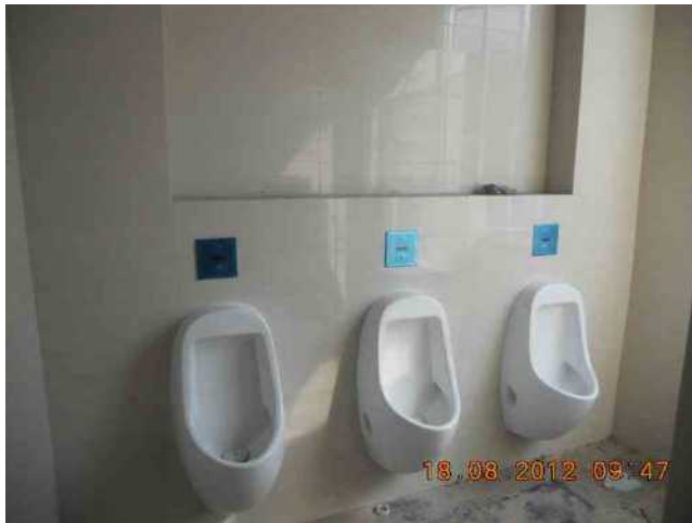
2 nd STY toilet completed with sanitary fittings