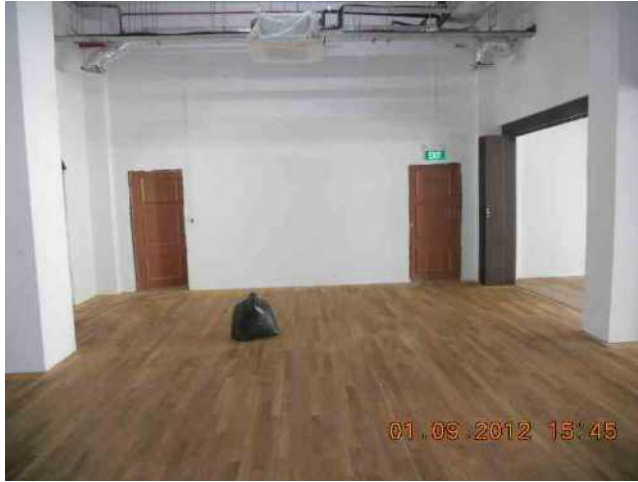
Doors installed at 1 st STY