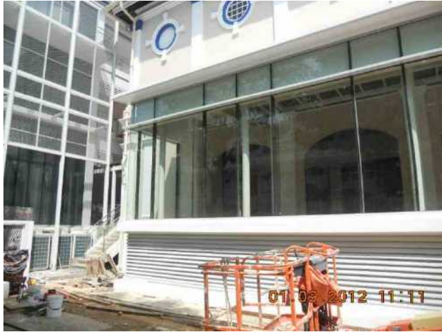
Left side wing completed (timber floor, glass curtain wall, smoothing of column, painting, ACMV & electrical)