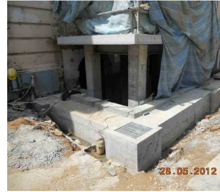
Drain works completed at both side of the