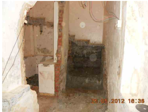
Existing staircase to basement was completely