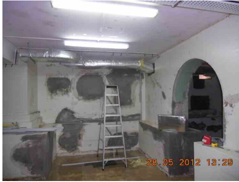
ACMV work start on the 28 th of May