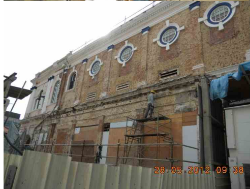
Removing of plaster at façade completed excep