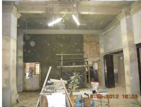
Removing of old plaster & re-plastering in prog