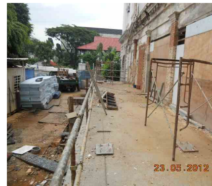
Condeck slab at right wing completely con