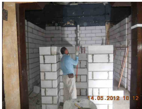
Construction of toilet at 1 St Storey completed.