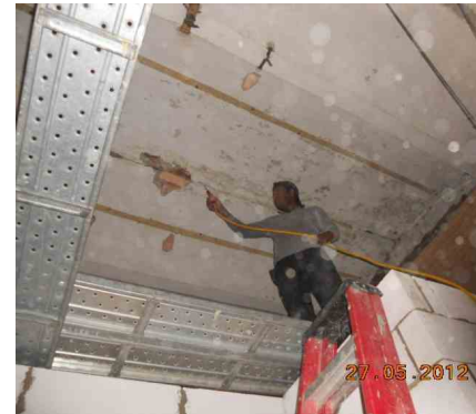
Clean the crack & prepare for Epoxy injection at the 2 nd STY slab soffit.