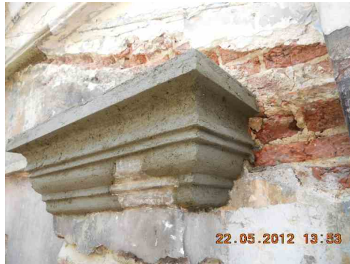
Repairing of the features is in progress.