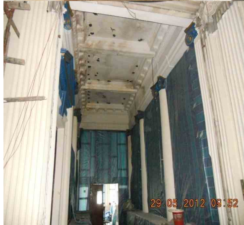
Removing of the partition at 2 nd STY entrance t completed