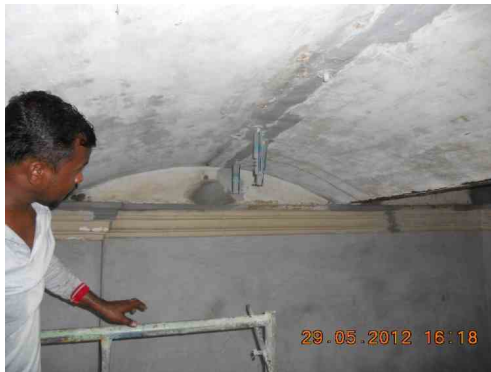
Epoxy injection at crack line in progress