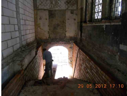
Forming break wall in progress at ST-04