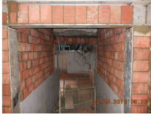
Construction of ramp at basement completed.