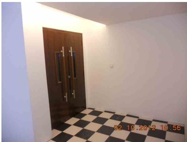
Entrance to basement bar