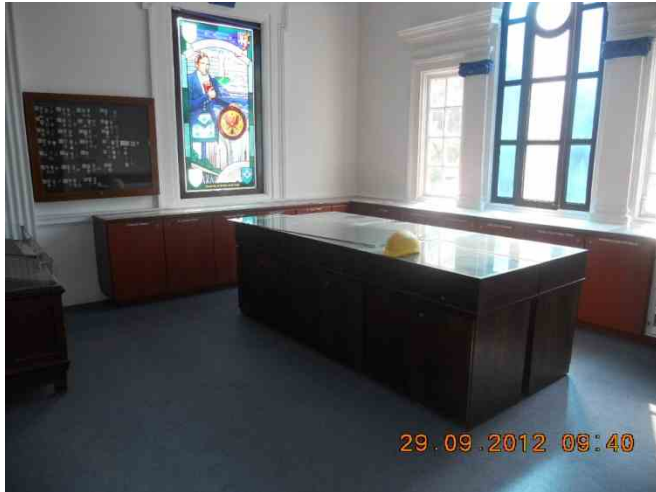
BREAKOUT ROOM 2 carpet finished.