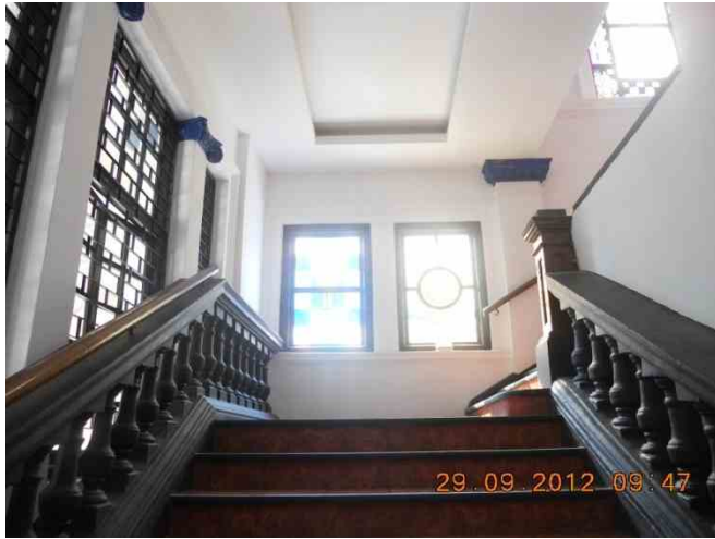
Staircase to 2 nd STY completed with fire rated ceiling