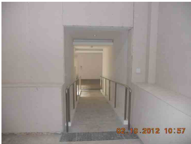
Handicap Ramp to annex building