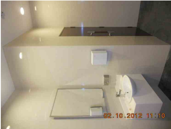
Basin, mirror & hand dryer completed