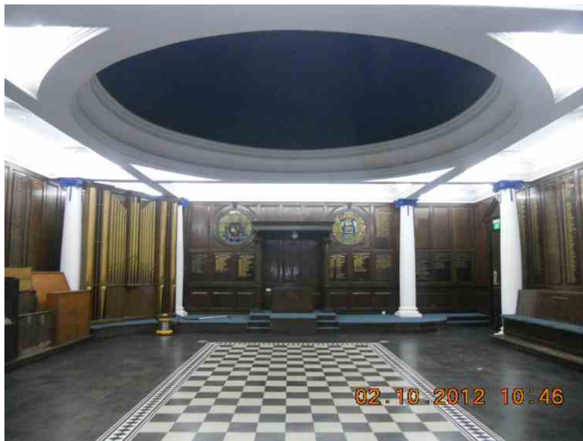
MAIN TEMPLE ROOM completed with new ceiling & ACMV