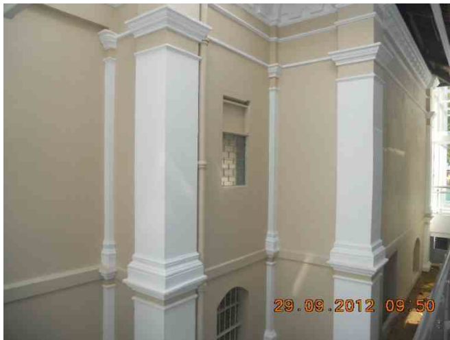
Back facades with smooth finished