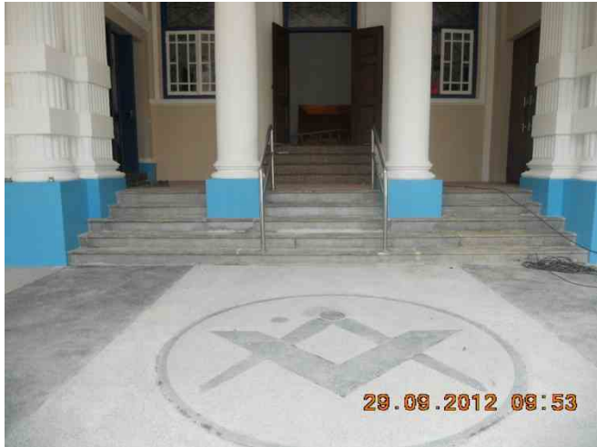
Non suspended slab with pebble wash finished@ car poach