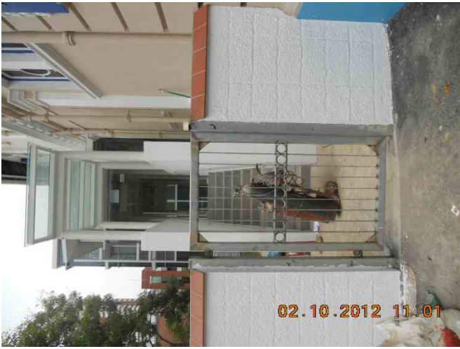
Gate door to 1STY restaurant