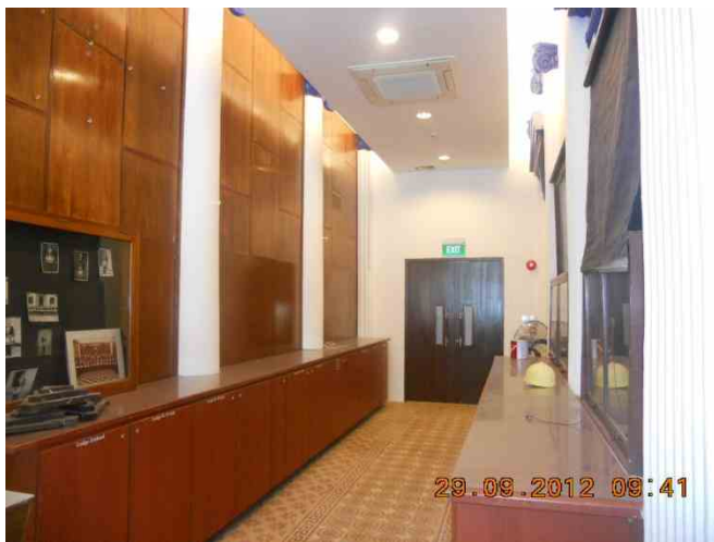
GALLERIA completed with ceiling, cove light & ACMV