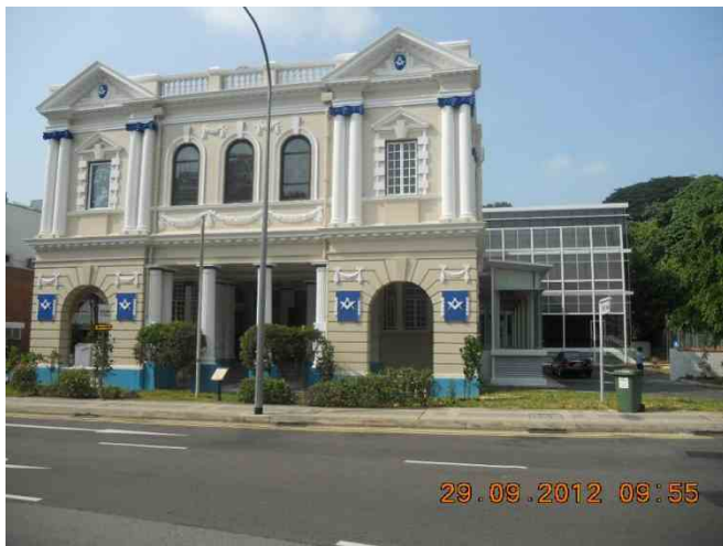
Facades completed by re plastering & painting