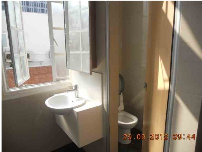
Toilet @ 2 nd STY completed basin, WC & sanitary wares