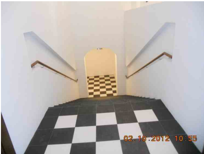
Staircase to basement completed with floor tiles & hand rail