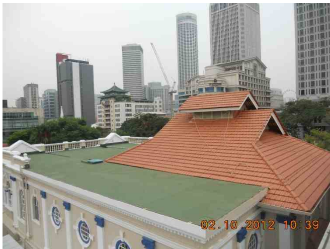
Flat roof with water proof membranes finished