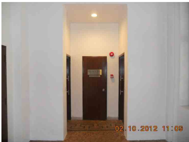
Toilet @ 1 st STY