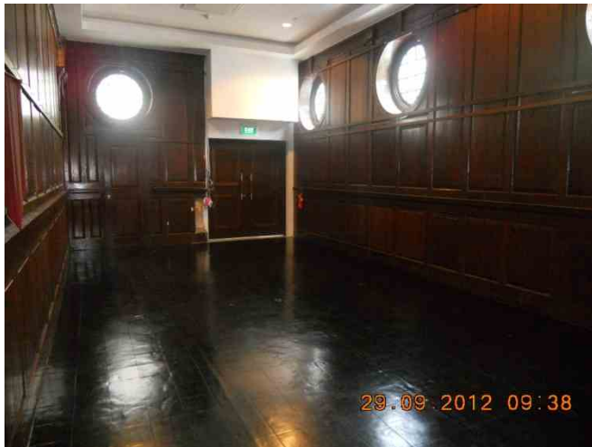
BREAKOUT ROOM 1 ceiling with cove light &ACMV