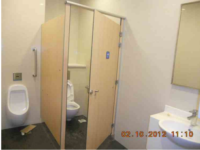
Completed with WC, urinal & sanitary accessory