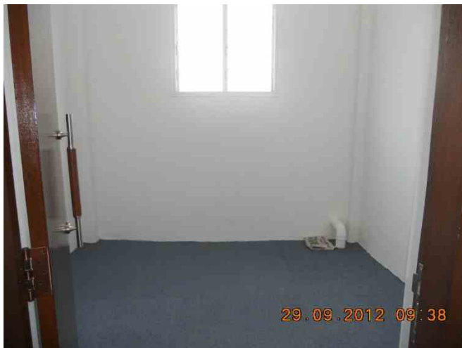
REFLECTION ROOM with carpet finished