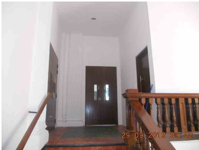
Completed with fire rated door @ staircase lobby