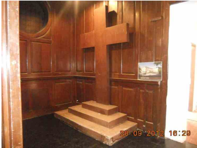
Existing store (Club house)