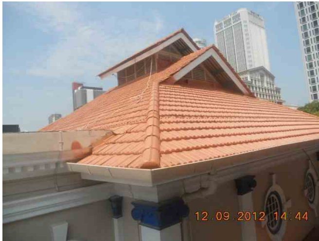
Pitch roof completed with colour painted.

Landscape , car park lots (turfing) and drive way (tarmac finished) are completed. Gate for the car park lots and garden have been completed.