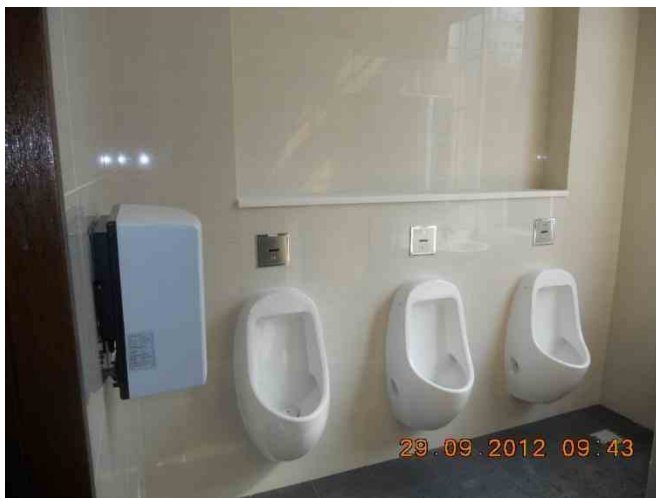
Sensor Urinal @ 2 nd STY TOILET