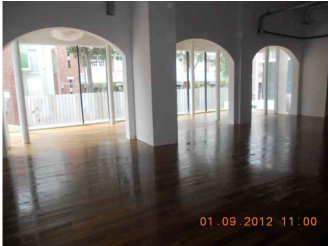
1 st STY timber floor finished & ACMV complete