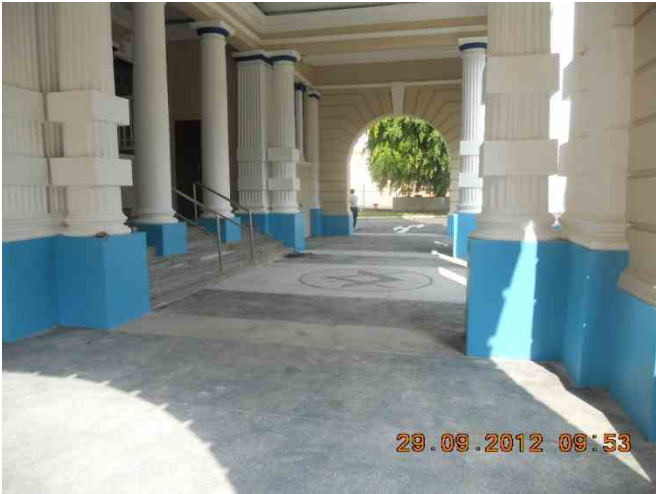
Car poach with cove lighting