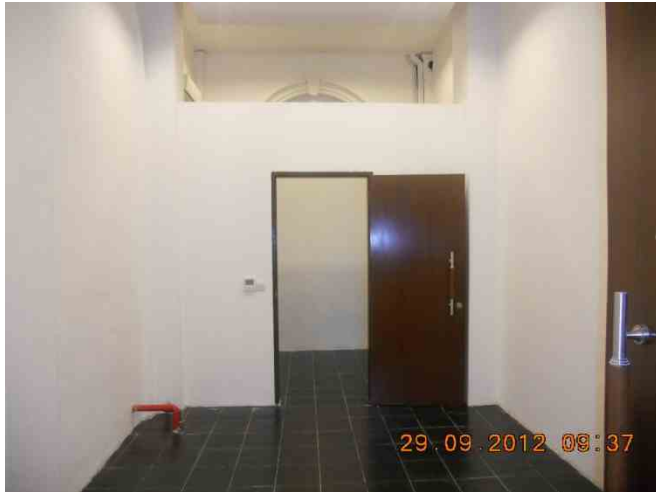
WAITING ROOM with vinyl tiles completed