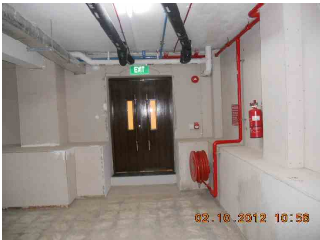
Basement bar completed with ventilated wall