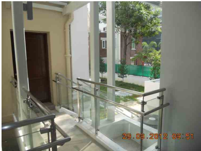
Link to Kitchen