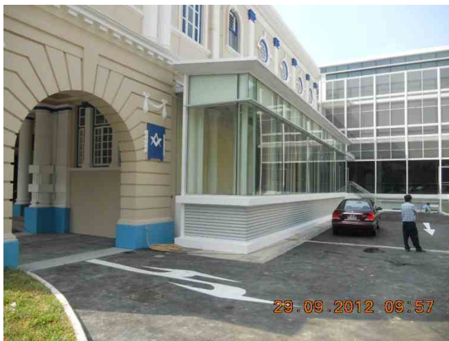
Drive way completed with Tarmac finished.