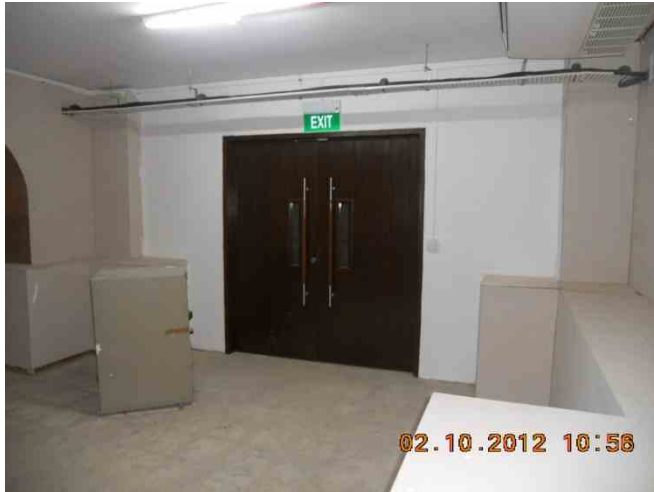
Fire rated door to link way