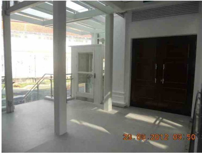
Lift lobby @ 1 st STY